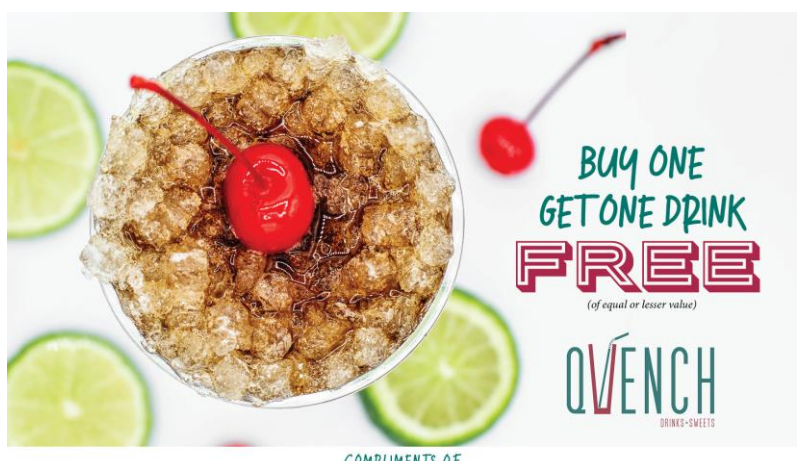
YOUR Name YOUR Company Name